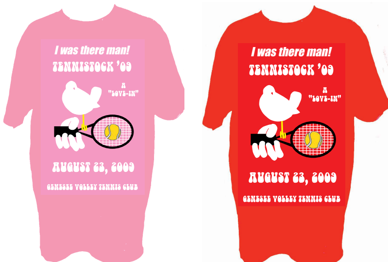
Pink T-shirts come in women's cut, red in men's cut